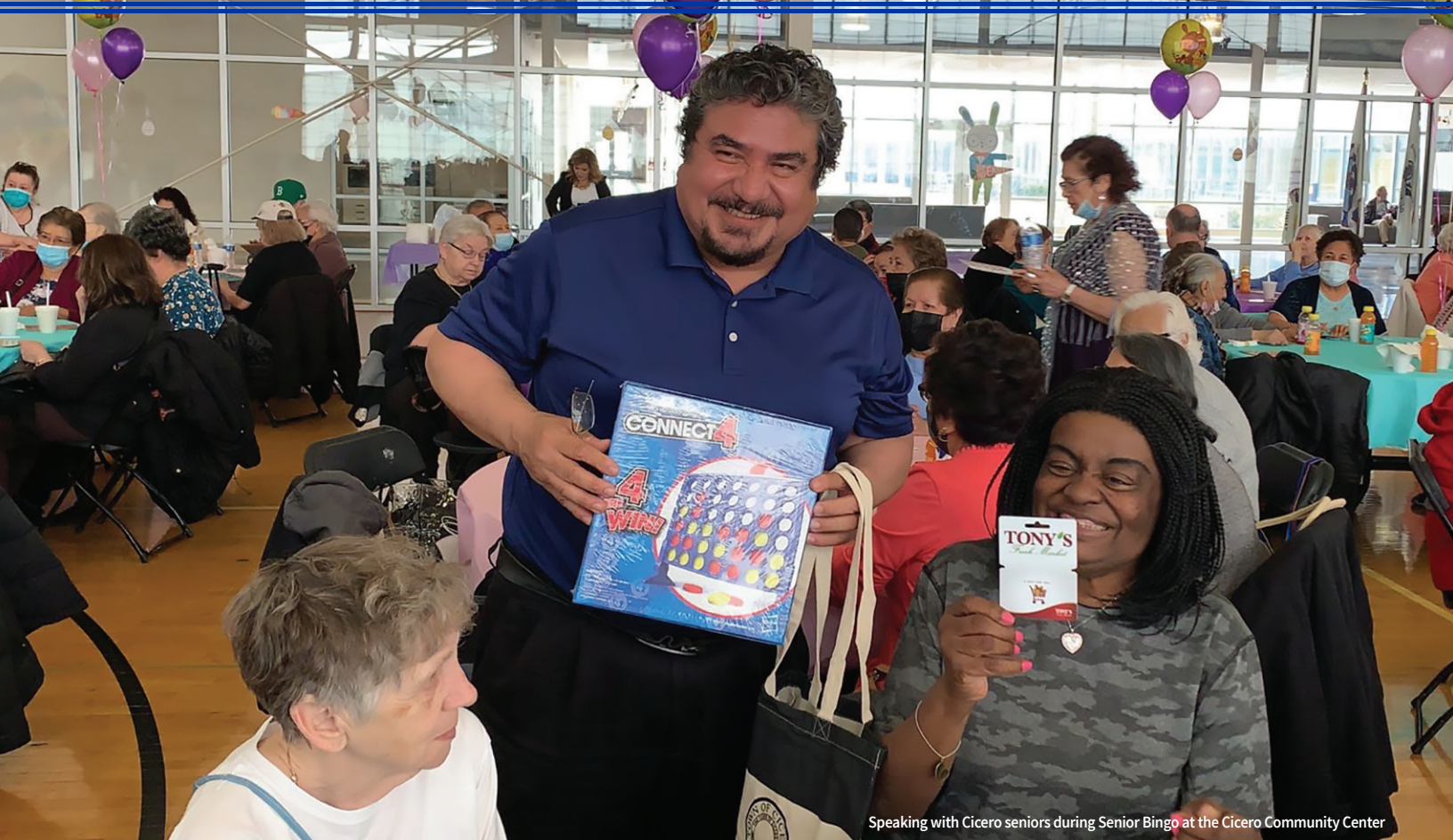
Speaking with Cicero seniors during Senior Bingo at the Cicero Community Center

★ STATE OF THE 16 TH DISTRICT | FALL 2022 ★