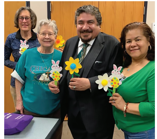
At Cicero Library with Crafts for Seniors during their twice-monthly meeting