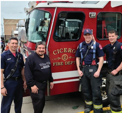
With Cicero First Responders