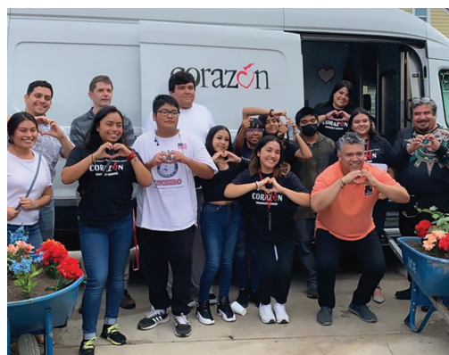
With Corazon Community Services staff and friends