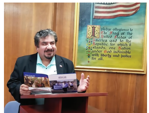
Reporting on the State of the District at Summit board meeting