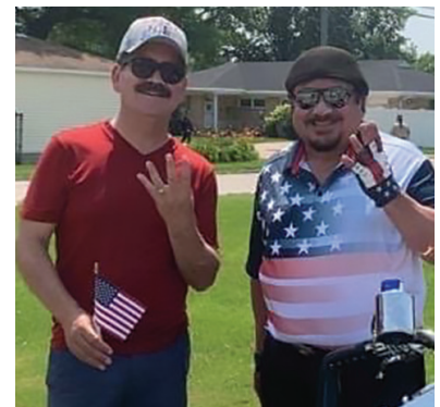
With Congressman Jesus "Chuy" Garcia at the Westchester 4th of July Parade